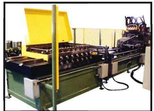
Integrated Rollform, Tangent Form & Welding Application