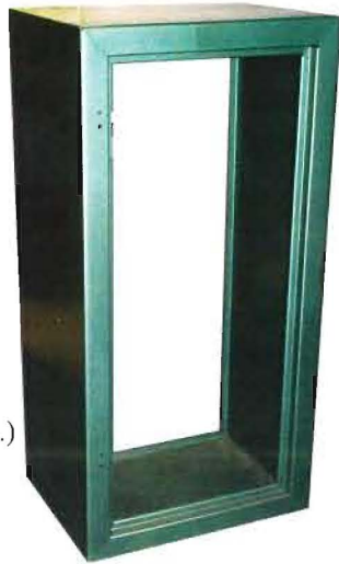
Gun Safes (10, 11 & 12 Ga.) Steel Coil Fed, Rollform Flanges, Programmed Tangent Former 24" x 24" to 36" x 72" Full Wrapper (3 depths)