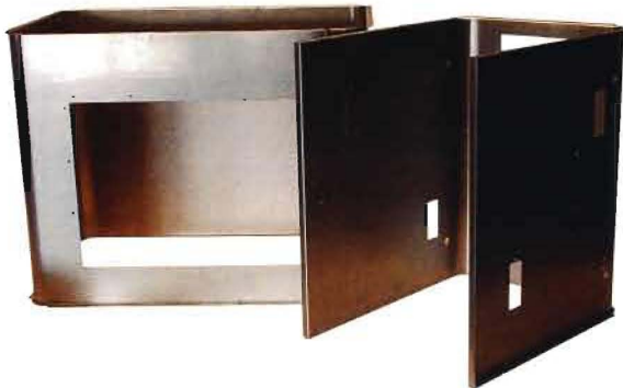
Oven Cavities (18 Ga.) Blank Fed 12 Different Sizes & Styles, 'U' Shape & Full Wrapper Automatic Program & Inline Welding