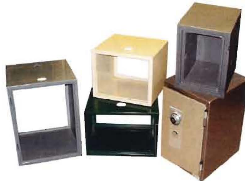
Personal Safes (18 Ga.) Coil Feed 12 Different Sizes & Styles, Full Wrapper Design with Inline Welding