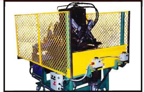
Manual Load System to form & clinch three (3) sided wrapper