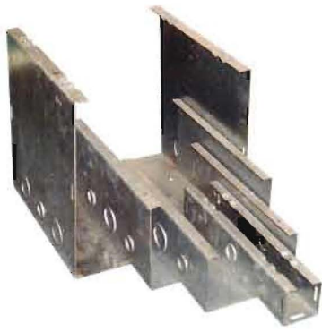
Electrical Wireway 2 1/2" x 2 1/2" (16 Ga.) 12" to 12" Sq. & Rect. - 1' to 10' lengths