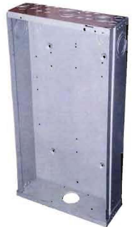
Electrical Enclosure Boxes (16 Ga.) 18" to 48" Lg. (14 parts per minute)