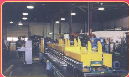
Coil Strip Feed, Gasket Feed, Punch/Notch, Rollform, Toggle-Lock & Cut-To-Length System