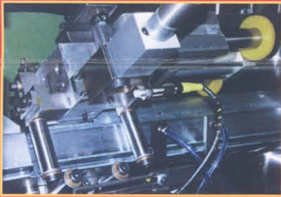
In-Line Flying Toggle-Lock Unit to punch and lock the two edge flanges together forming the finished tubular rail section.